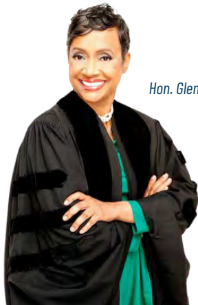
Hon. Glenda Hatchett

The annual Northwest Ohio Access to Justice Awards Dinner took place in person after a two-year hiatus due to the COVID-19 pandemic. More than 300 guests attended the event, held on May 12, 2022, at The Pinnacle in Maumee in support of ABLE , Legal Aid of Western Ohio, Inc. (LAWO), and the Toledo Bar Association Pro Bono Legal Services Program (TBA) and our combined efforts to assist people living in poverty with critical legal services.