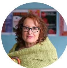
Beatriz Maya Community Advocacy Award