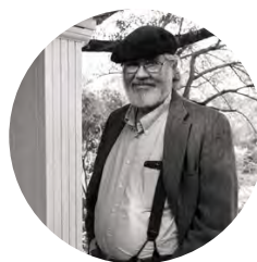
David L. Beckwith Community Advocacy Award